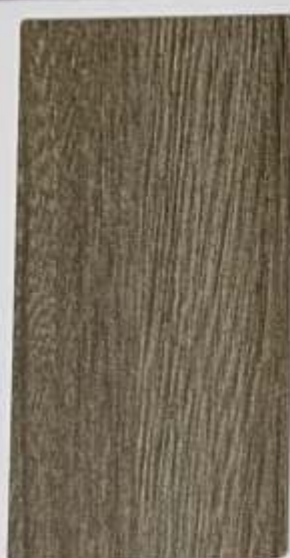
Cambridge Walnut (PMH) 3451 - SD