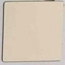
Pink Irish Cream (M) NEW 1139 - SD