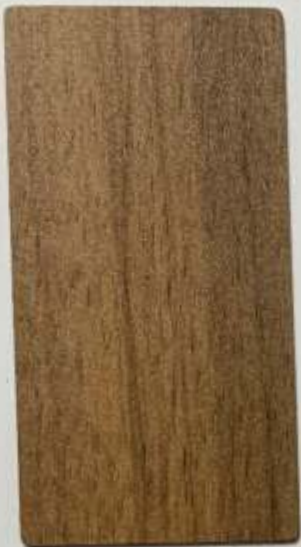
Exotic Teak (PMH) 3365 - SD