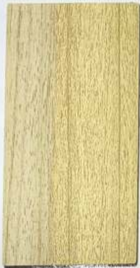
Mysore Teak (PMH) 3389 - SD