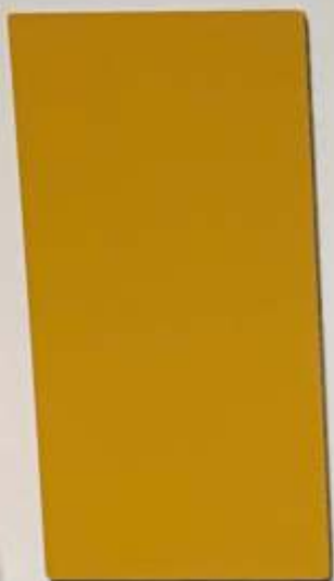
Pastel Orange (PMH) 1133 - SD