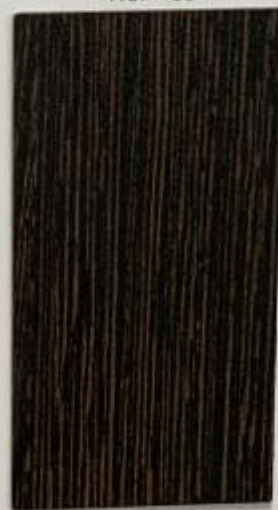
Straight Grained Wenge (PMH) 3008 - SD