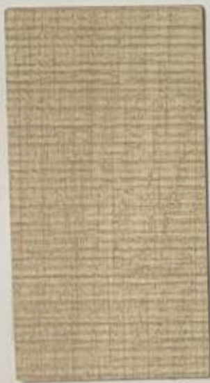
Sand Cross Line (PMH) 3045 - SD