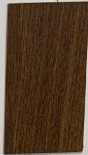
Classic Planked Walnut (PMH) 3009 - SD