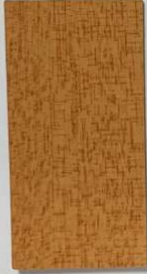
Khaya Mahogany (PMH) 3021 - SD