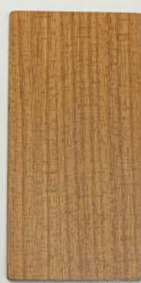
Swiss Oak (MS) 3043 - SD