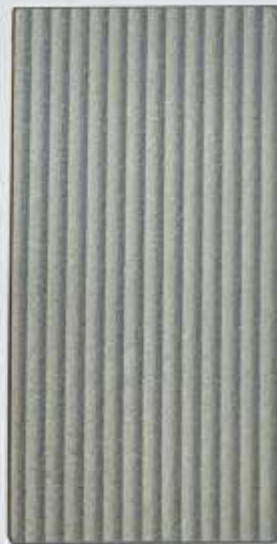
Alu Wave (MH) 1112 - SD