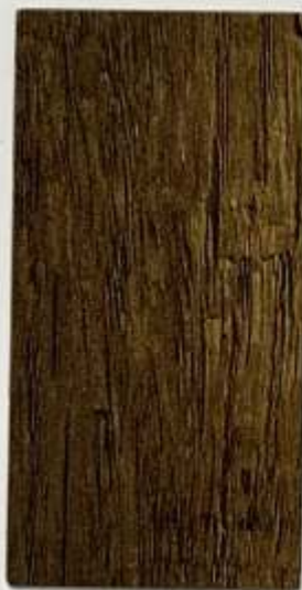
Dark Choco Oak (PMH) 3420 - SD NEW