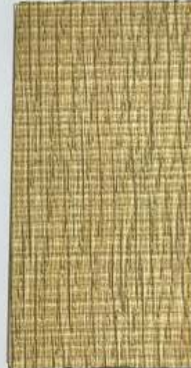
Light Oak (MH) 3407 - SD