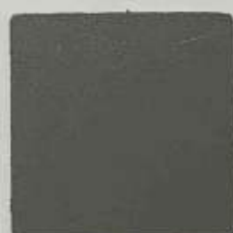
Gothic Grey (PMH) 1113 - SD