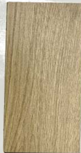
Laurel Oak Light (PMH) 3415 - SD