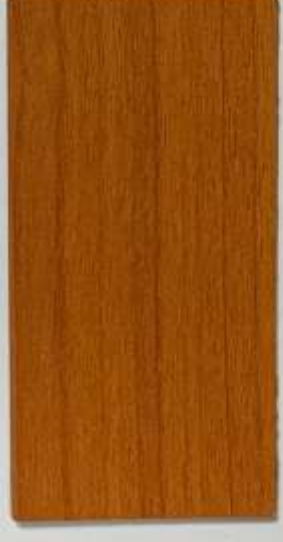
Oxford Cherry (PMH) 3022 - SD