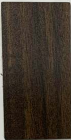
Choco Walnut (PMH) 3370 - SD