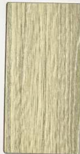
Cream Walnut (PMH) 3450 - SD