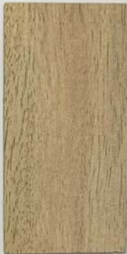
Persian Walnut (PMH) 3371 - SD