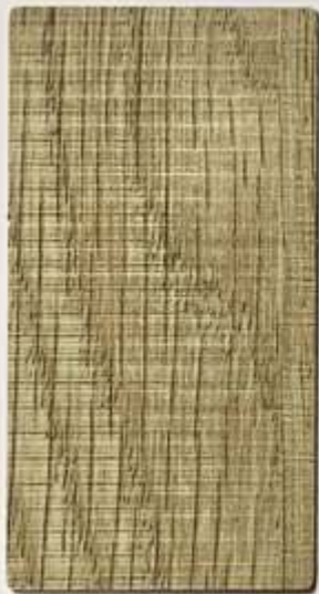
Ivory Oak (PMH) 3408 - SD