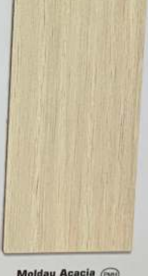
Moldau Acacia (PMH) (Light) 3025 - SD