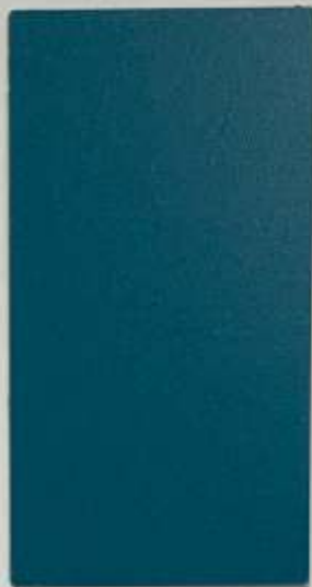
Ocean Green (PMH) 1136 - SD