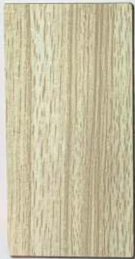
White Teak (PMH) 3403 - SD