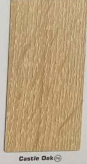
Castle Oak (PM) 3363 - SD