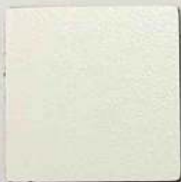
Everest White (PMH) 1102 - SD