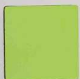
Parrot Green (PMH) 1119 - SD