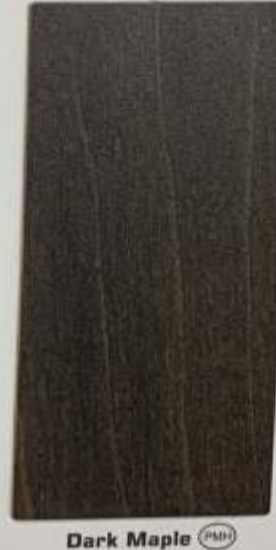
Dark Maple (PMH) 3362 - SD