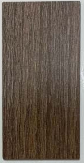
Noce Di Vinci (PMH) 3017 - SD