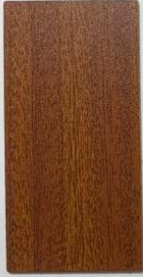
Sapelli (PMH) 3015 - SD