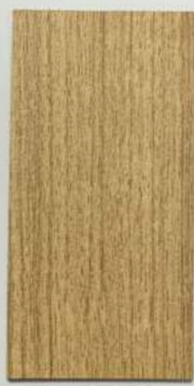
Elegant Teak (PMH) 3041 - SD