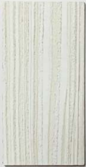
New Country (PM) (Light) 3013 - SD