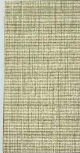
Fab Cream (PMH) 3406 - SD