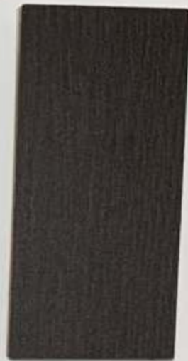
Wenge Brown (PMH) 3377 - SD