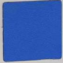
Hong Kong Blue (PMH) NEW 1138 - SD