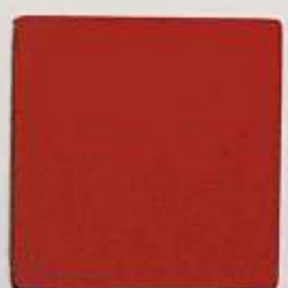
Cardinal Red (PMH) 1107 - SD