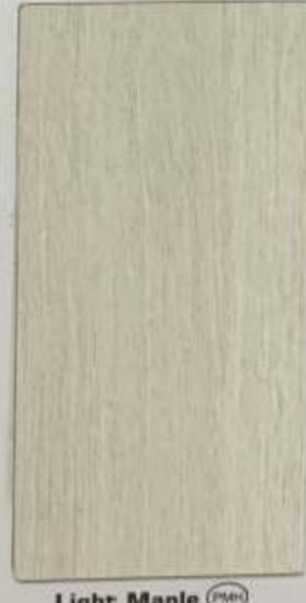
Light Maple (PMH) 3361 - SD