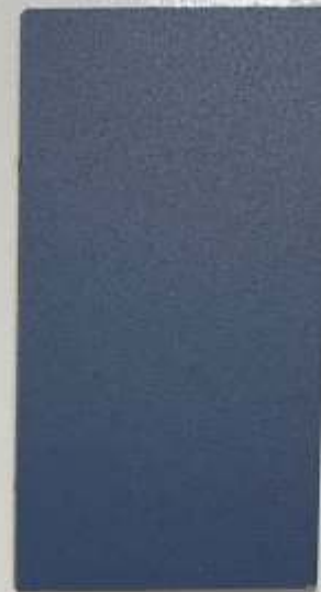
Persian Blue (PMH) 1137 - SD