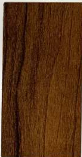
Brazilian Walnut (PMH) 3419 - SD