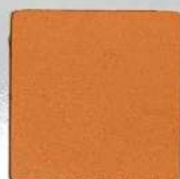
Orange (PMH) 1116 - SD