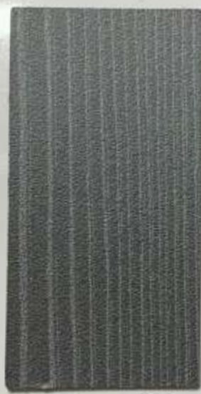
New Country (PMH) (Dark) 3028 - SD