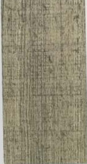
Fibre Grey (PMH) 3453 - SD