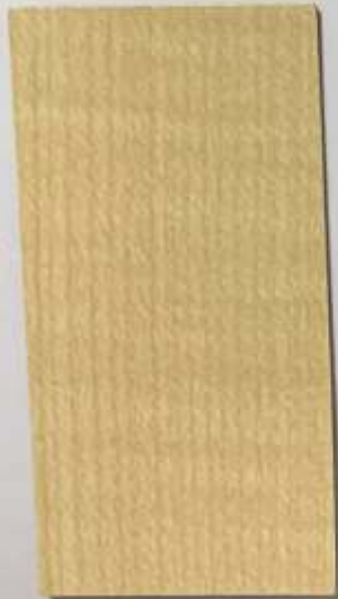
Thansau Maple (P) 3020 - SD