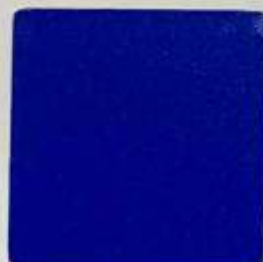
Electric Blue (PMH) 1109 - SD