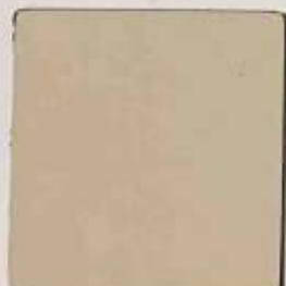
Irish Cream (MH) 1120 - SD