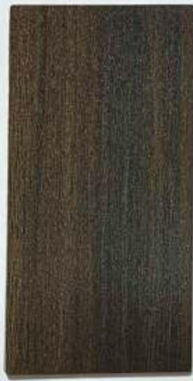
Brown Teak (PMH) 3390 - SD