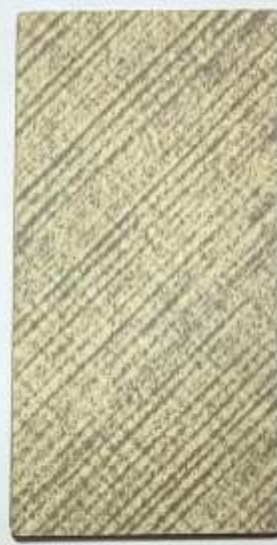
Mesh Cream (PMH) 3391 - SD