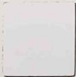
Super White (PMH) 1101 - SD