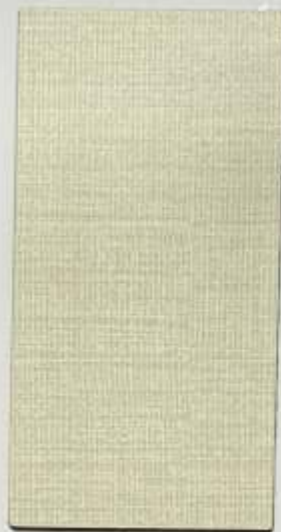
Linen Ivory (PMH) 3414 - SD