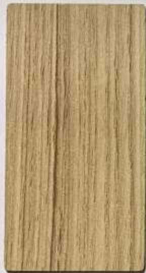
Burma Teak (PMH) 3412 - SD