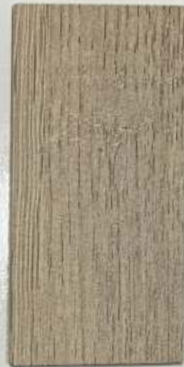
Alabaster Teak (PMH) 3373 - SD NEW