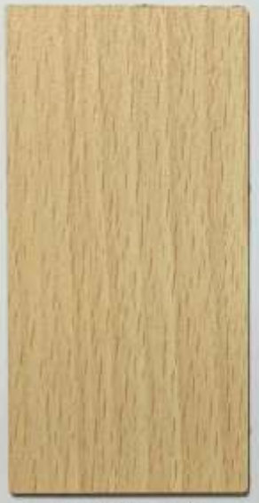
Inntal Beech (P) 3016 - SD