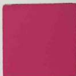
Hutch Pink (PMH) 1126 - SD