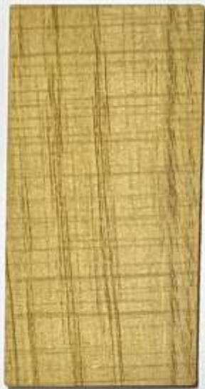
Golden Cross Line (PMH) 3387 - SD