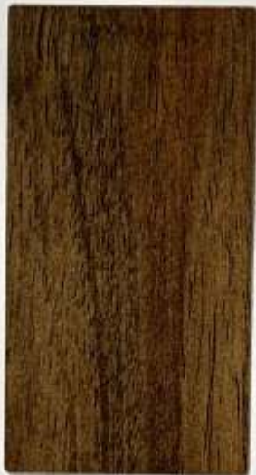
Ebony Walnut (PMH) 3418 - SD