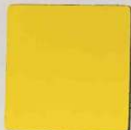
Marigold Yellow (PMH) 1108 - SD