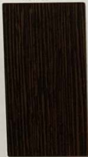
Flowery Wenge (PMH) 3002 - SD