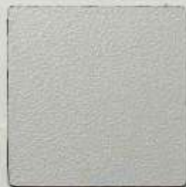
Silver Grey (PMH) 1104 - SD