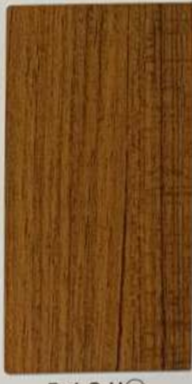
Teak Gold (MS) 3091 - SD