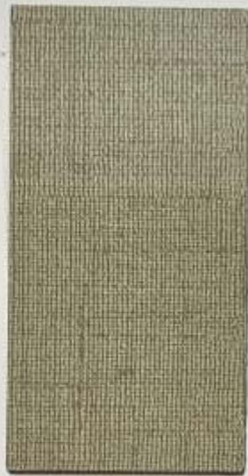
Linen Metallic (PMH) 3413 - SD