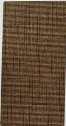
Fab Chocos (PMH) 3405 - SD