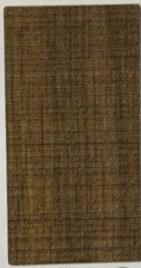
Choco Cross Line (PMH) 3046 - SD