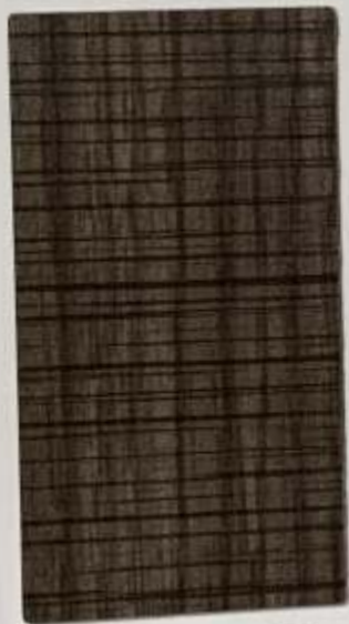
Grey Cross Line (PMH) 3386 - SD