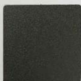
Slate Grey (PMH) 1105 - SD