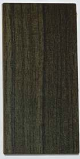
Thai Teak (PMH) 3402 - SD