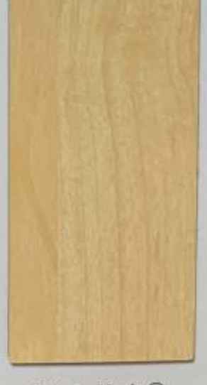
Alberta Maple (P) 3023 - SD