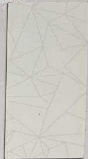
White Diamond Cut (P) 1150 - SD