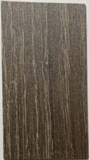
Choco Oak (PMH) 3364 - SD