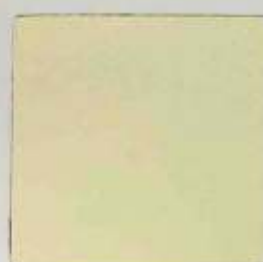
Ivory (PMH) 1111 - SD