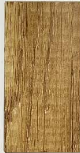
Gold Wood Oak (PMH) 3421 - SD NEW