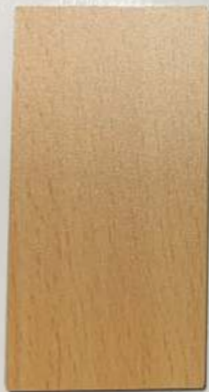
Bavarian Beech (PMH) 3027 - SD