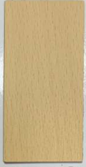
Mangfall Beech (PMH) 3018 - SD