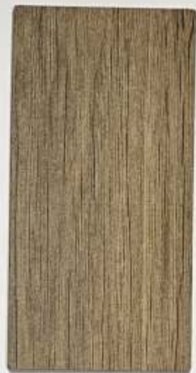
Laurel Oak Dark (PMH) 3416 - SD