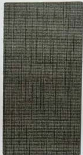
Fab Grey (PMH) 3404 - SD