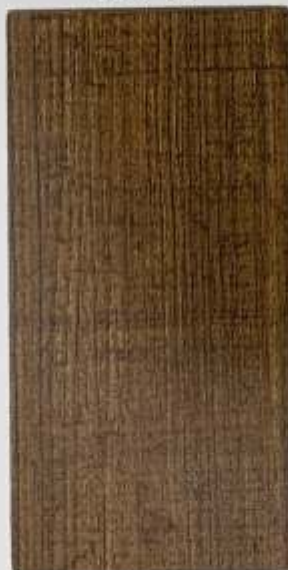
Fibre Teak (PMH) 3455 - SD