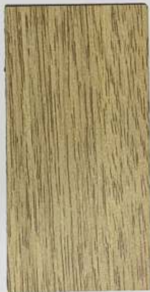
Beige Walnut (PMH) 3482 - SD