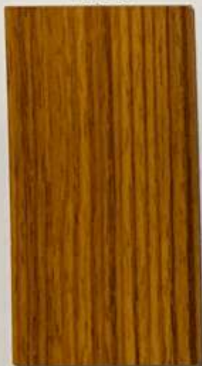
Natural Teak (PMH) 3001 - SD