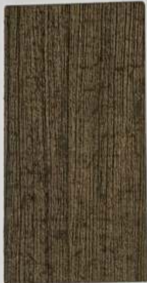
Fibre Rust (PMH) 3452 - SD