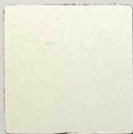
Frosty White (PMH) 1103 - SD