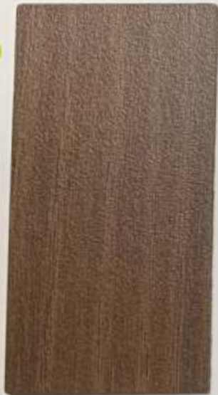
Moldau Acacia (PMH) (Dark) 3026 - SD