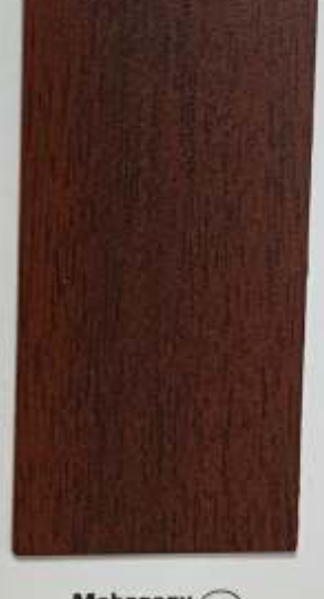
Mahogany (PMH) 3024 - SD