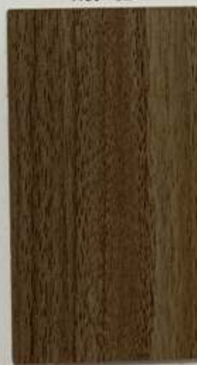
Lorraine Walnut (PMH) 3007 - SD