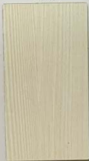
Highland Pine (PMH) 3003 - SD