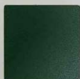
Spanish Green (PMH) 1115 - SD