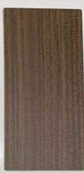
Indian Oak (PMH) 3044 - SD