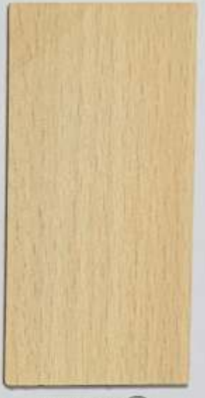
Ice Beech (PMH) 3019 - SD