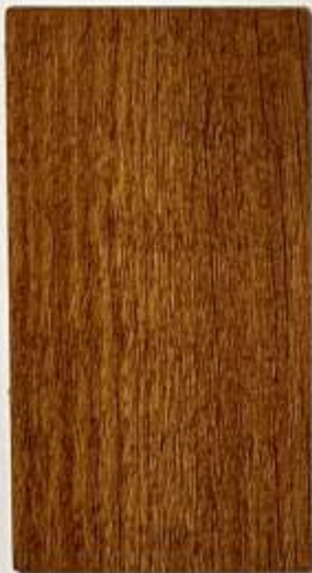
Cherry Pine (PMH) 3417 - SD