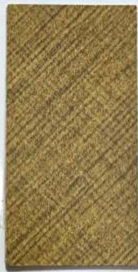
Mesh Gold (P) 3392 - SD