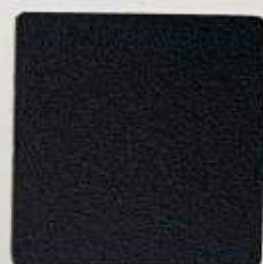
Black (PMH) 1106 - SD