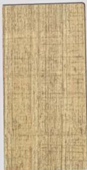
Fibre Gold (PMH) 3454 - SD